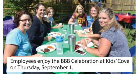
Employees enjoy the BBB Celebration at Kids' Cove on Thursday, September 1.