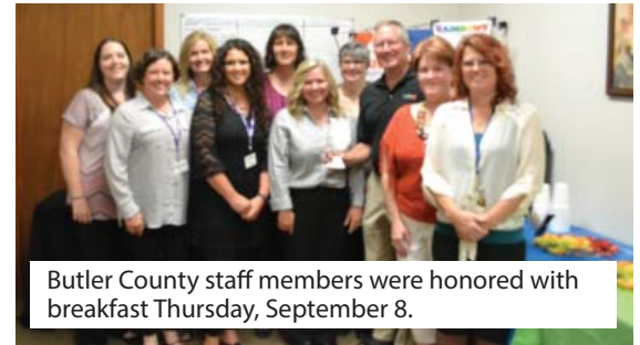
Butler County staff members were honored with breakfast Thursday, September 8.