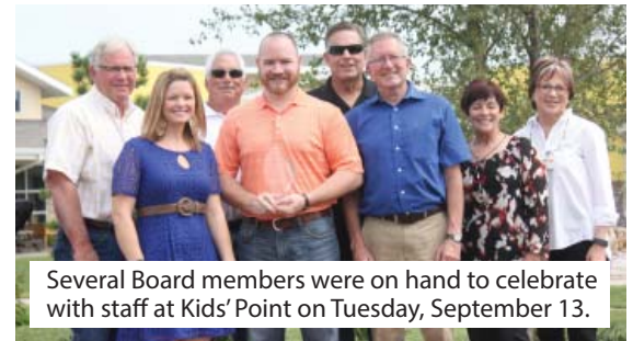
Several Board members were on hand to celebrate with staff at Kids' Point on Tuesday, September 13.